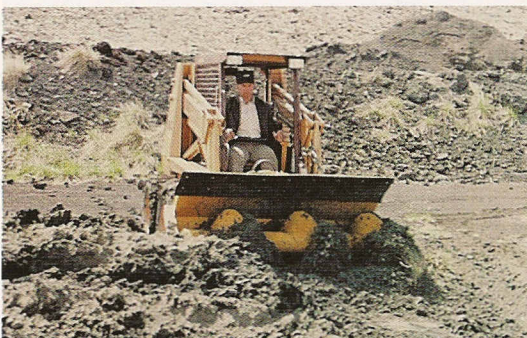
R24C With Continuous Aerator