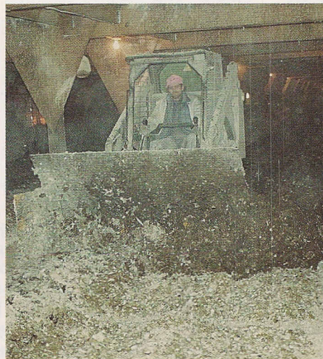
R24C Paddle Aerator