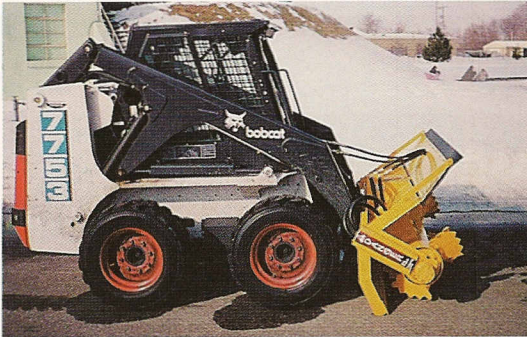
R24B With Paddle Aerator

SIMPLE PROCEDURE: The aerator works directly into the bed of material, for alleyways are not required when using the Brown aerator, so there is a good material from the bottom up and to the side, assuring complete mixing and a material mover has been proven with over 30 years experience in plow wearplates or paddles, both of which are easily replaced.