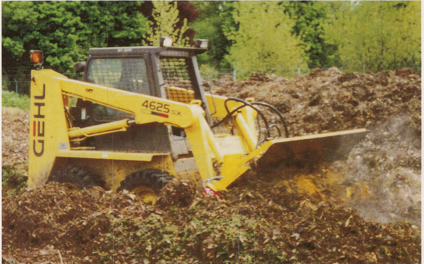
R24C Paddle Aerator