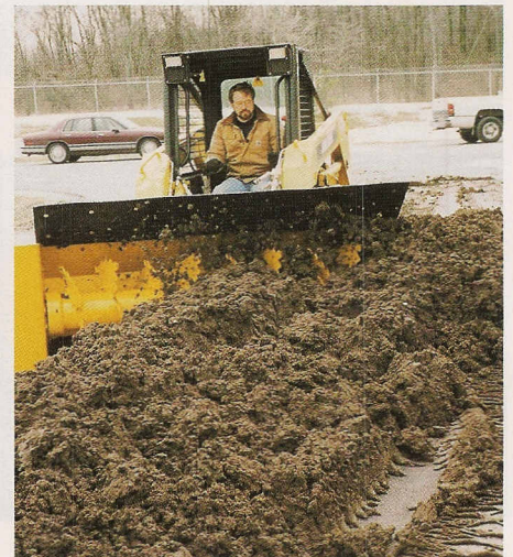
R24C Paddle Aerator