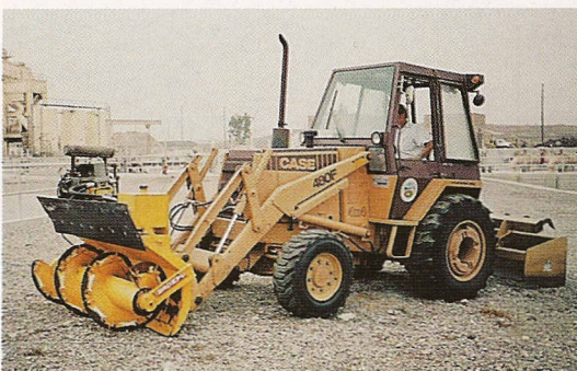
SC24E, Continuous, Gas