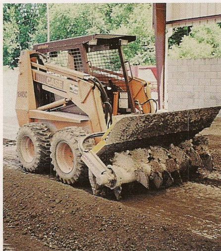
R24C Paddle Aerator