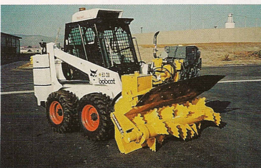
SC24D, Paddle, Diesel